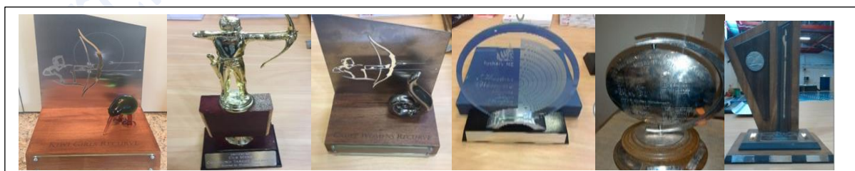
L-R Kiwi Girls Recurve, Cub Boys Compound; Cadet Womens Recurve; Masters Womens Recurve, Senior Mens Recurve, Senior Womens Compound