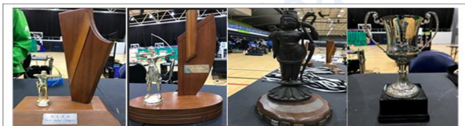
L-R NZAA Mens Indoor Champion, NZAA Ladies Indoor Champion, NZAA National Indoors Compound Open, ANZ National Indoors Womens Compound Champion