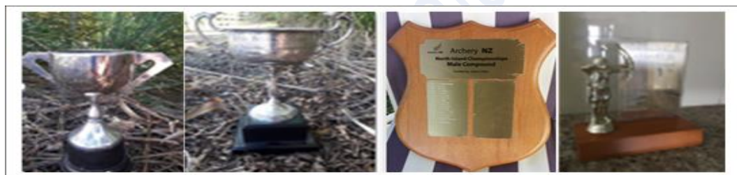
L-R J.B Wills Cup -Recurve Male, J.B Willis Cup- Recurve Female, Compound Male, North Island Archery - Ladies Compound