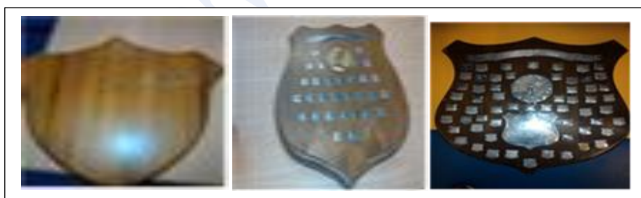
L-R Archery New Zealand League Champions Shield; Fraser Shield; Ryan Shield. (Hamilton Shield to be added)

https://www.archerynz.co.nz/nz-postal-leagues/postal-league-news/