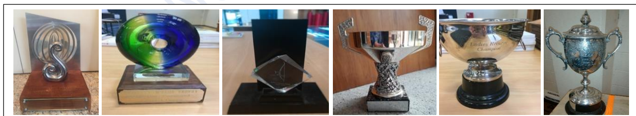
L-R- Youth Girls Compound, Youth Boys Compound, Junior Mens Recurve, Masters Mens Barebow, Senior Womens Recurve, Senior Mens Recurve