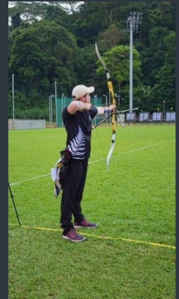
At Bukit Gombak Stadium