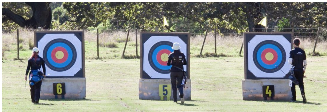
CQT at Auckland Archery Club.