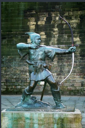
A statue of Robin Hood is installed at Nottingham Castle, Nottingham, England. It was unveiled in 1952.

CQT, Auckland Archery Club.