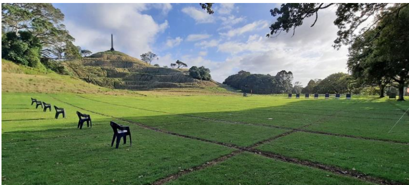
CQT at Auckland Archery Club.