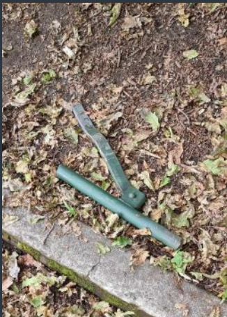
Above: Damage to the containers at River Glade Archers. Below : The type of bow stolen from Grey Goose Wing Society.