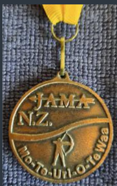
The original JAMA medal

Archery NZ and Archery Australia have started a discussion about the 2025 Trans Tasman. On the agenda is whether Barebow is included and/or the new U15 Age Group used. NZ will be hosting the Tournament in 2025. So far the best dates that coincide with both countries school holidays are in April.