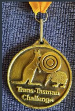
The original Trans-Tasman Challenge medal